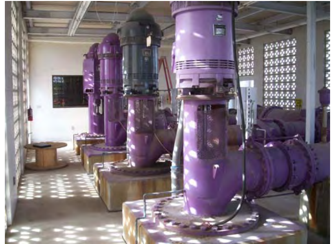
Cape Coral, FL 24EHM – 2 stage, 5,000 GPM @ 173 300 HP @ 1200 RPM Sold by Barney’s Pumps, Inc.