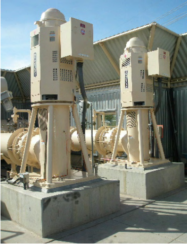
Phoenix, AZ 36GM – 1 stage 15,000 GPM @ 75’ 400 HP @ 900 RPM Sold by James, Cooke, & Hobson, Inc.