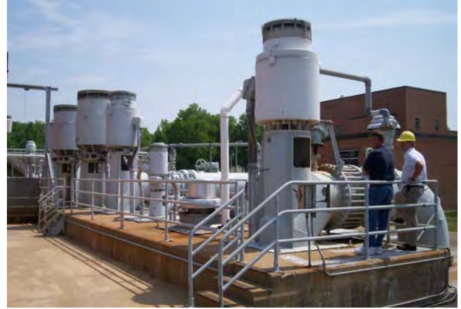
Fairfax County, VA 24P – 2 stage 22,500 GPM @ 50’, 400 HP @ 900 RPM 30P – 2 stage 27,300 GPM @ 50’, 500 HP @ 720 RPM 12EHM – 4 stage 800 GPM @ 180’, 50 HP @ 1800 RPM Sold by Wood Equipment Company