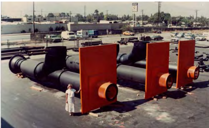
Many, many moons ago... Propeller pumps for an installation in Georgia Sold by General Pump and Machinery, Inc.

If you have a pump installation you’d like to share, send us a picture! Please include a brief description of the pump, service, and location. All submissions will receive a free gift from our Company Store.