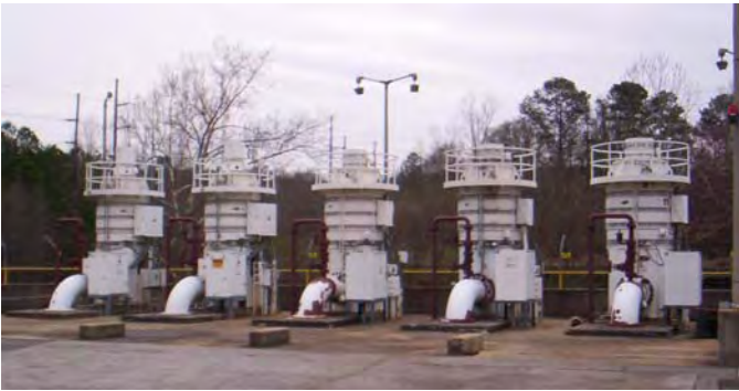
Birmingham, AL 38HOH – 5 stage, 14,000 GPM @ 460’ 2000 HP @ 900 RPM Sold by Dowdy & Associates, Inc.