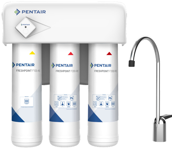
F3000-B2M, (with filter life monitor) shown